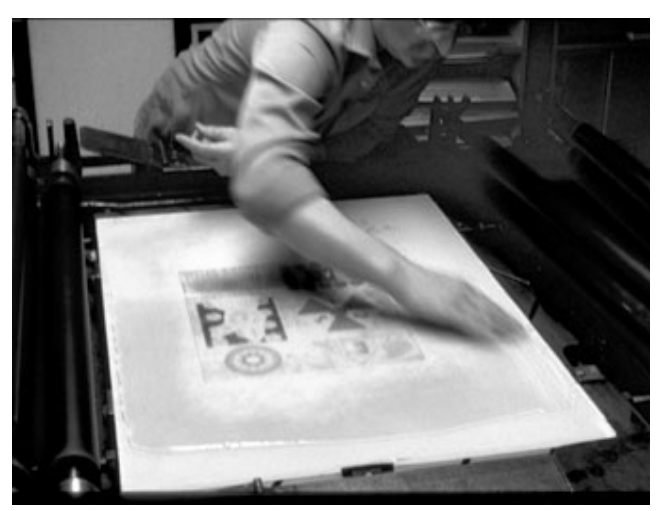
Spreading a glycerine fountain solution over the gelatine coated collotype plate- Lichtdruck Kunst Leipzig.

After exposure, the plate was rinsed with cold water until all the bichromate had dissolved clear of the gelatine. Before being placed on a press for printing, the now air dried plate was flooded with a fountain solution of glycerine and water, allowing the gelatine to absorb moisture in proportion to the amount of light hardening received. As a consequence the non-image areas absorbed the most, while the light hardened image areas absorbed the least ie the fully hardened shadow absorbed almost none, the deep tones a small amount and the lighter tones larger amounts. At this point, after the plate had been fully soaked and the excess glycerine blotted from its surface, it was placed on the press and a thin layer of greasy ink rolled over its surface. As with lithography, the ink was totally rejected by the moist non-image areas and attracted by the hardened grease loving image areas. However,