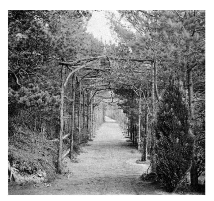
Collotype landscape printed circa 1930 by Waterlow & Sons Limited, London.

Collotype was one of the first photomechanical printing processes to be developed. It was invented in the mid-nineteenth century and pioneered the detailed photographic illustration of many important scientific and fine art publications of the time. During the 1880's the process was soon eclipsed by the rapid development of faster, and cheaper photomechanical techniques such as letterpress and offset lithography. From then on collotype was largely relegated to specialist markets such as the field of high quality, limited edition, fine art reproductions.